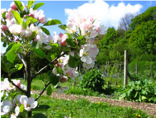
Blossom at Bowling Park Community Orchard

The idea of community orchards came from Common Ground's campaign to save vulnerable old orchards. In starting the Apple Day movement they used an annual event as a way of raising the profile of orchards. This has now extended to the planting of new orchards.