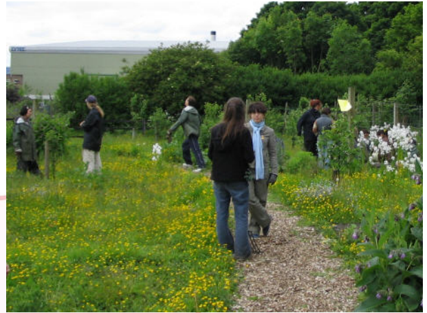
A volunteer day at Bowling Park Community Orchard

Bowling Park Community Orchard The largest Community Orchard in the District so far is Bowling Park Community Orchard, planted in 2003 on six disused allotments at the Bowling Park Allotment Site. The planting was facilitated by BEES (Bradford Environmental Education Service) and undertaken by a group of volunteers who now form the management team for the orchard. The orchard now has 26 types of apple, including old varieties, six kinds of pear tree, and other soft fruits.