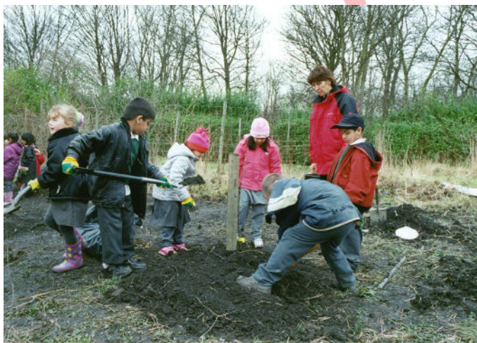
Children from Bowling Park Primary School planting apple trees

Glass Park Community Orchard, near Doncaster. A registered charity formed by Kirk Sandall Community Wildlife Group. They have a large site between the villages of Kirk Sandall and Barnby Dun, north-east of Doncaster. Information on the project can be found on www.doncaster.gov.uk